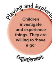
The Three Characteristics of Effective Learning of the Early Years Foundation Stage

Creative Focus: We will be carrying on developing the colour mixing skills that we have learnt throughout the year. We will be looking at Jackson Pollock and making 3D structures with junk modelling.